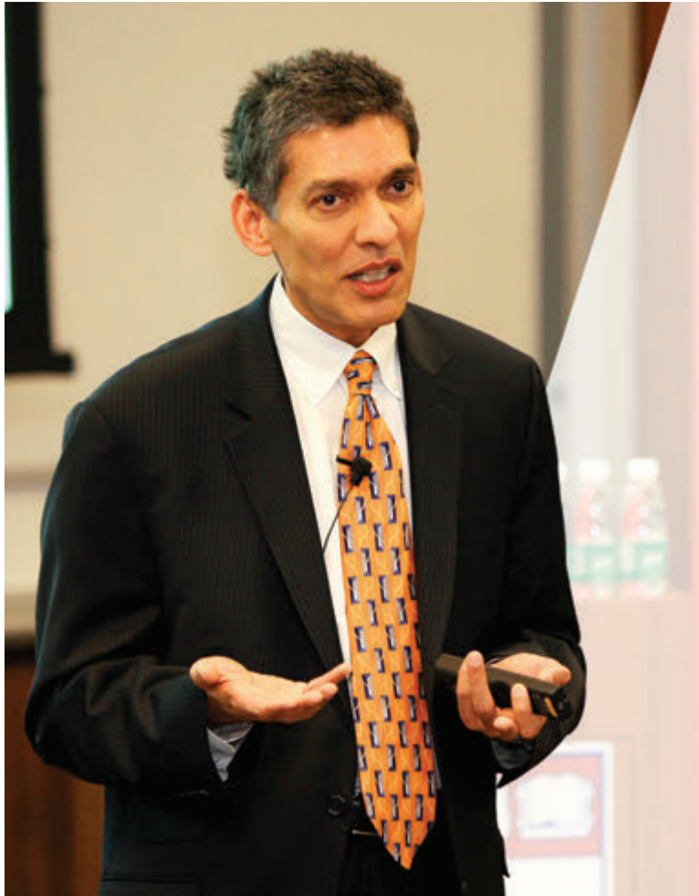
Economist Eswar Prasad disagrees with US President Donald Trump's assertion that China is intentionally keeping its currency lower so it can sell more goods on the world's markets. Prasad says that China is actually intervening to prevent the renminbi, or yuan, from dropping too much against the dollar.