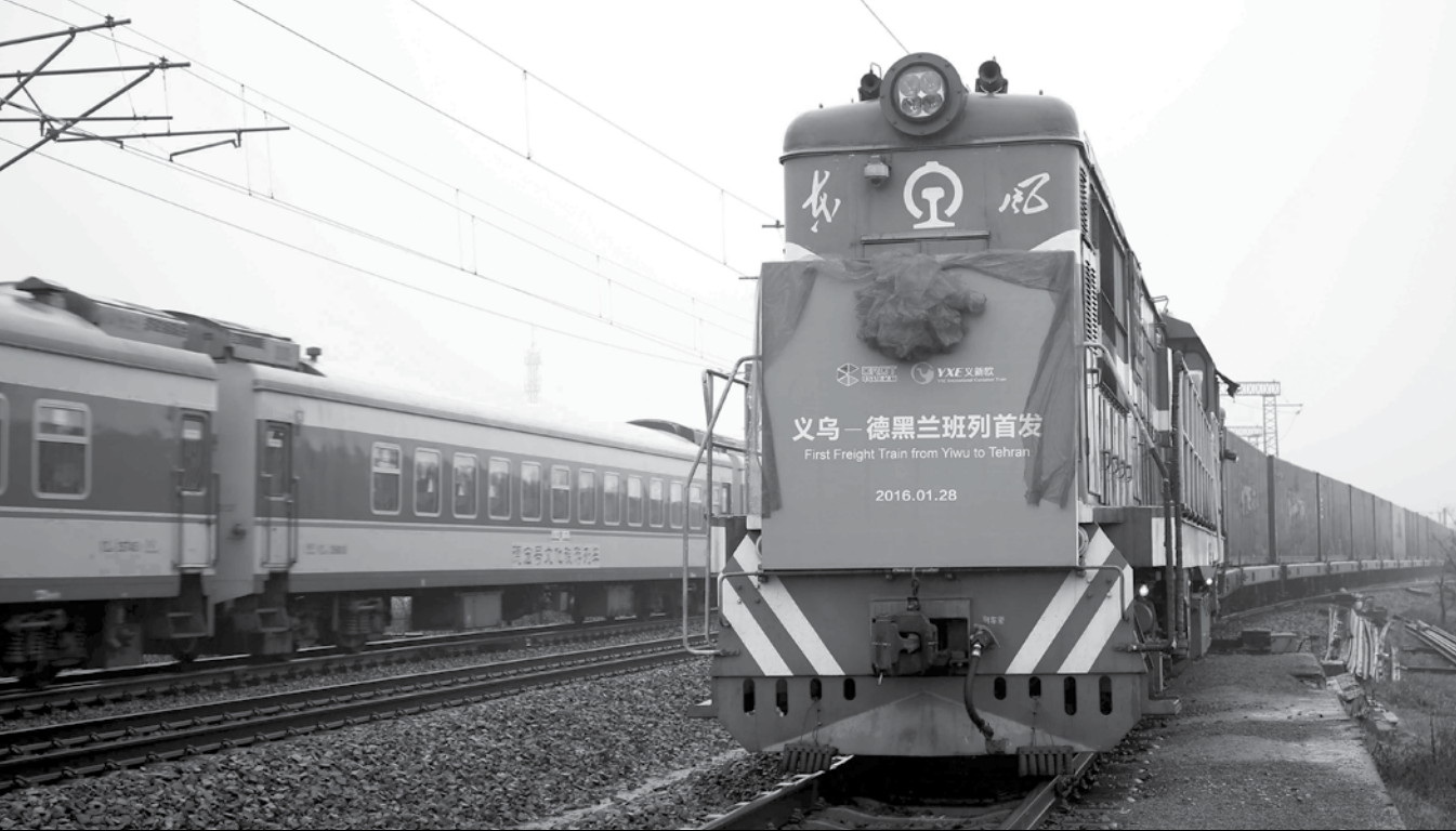
The first YXE international container train travelling from China to Iran.

facilitated the spread of Buddhism from India and of Islamic culture and religion from Arabia and Persia into Central Asia and China.