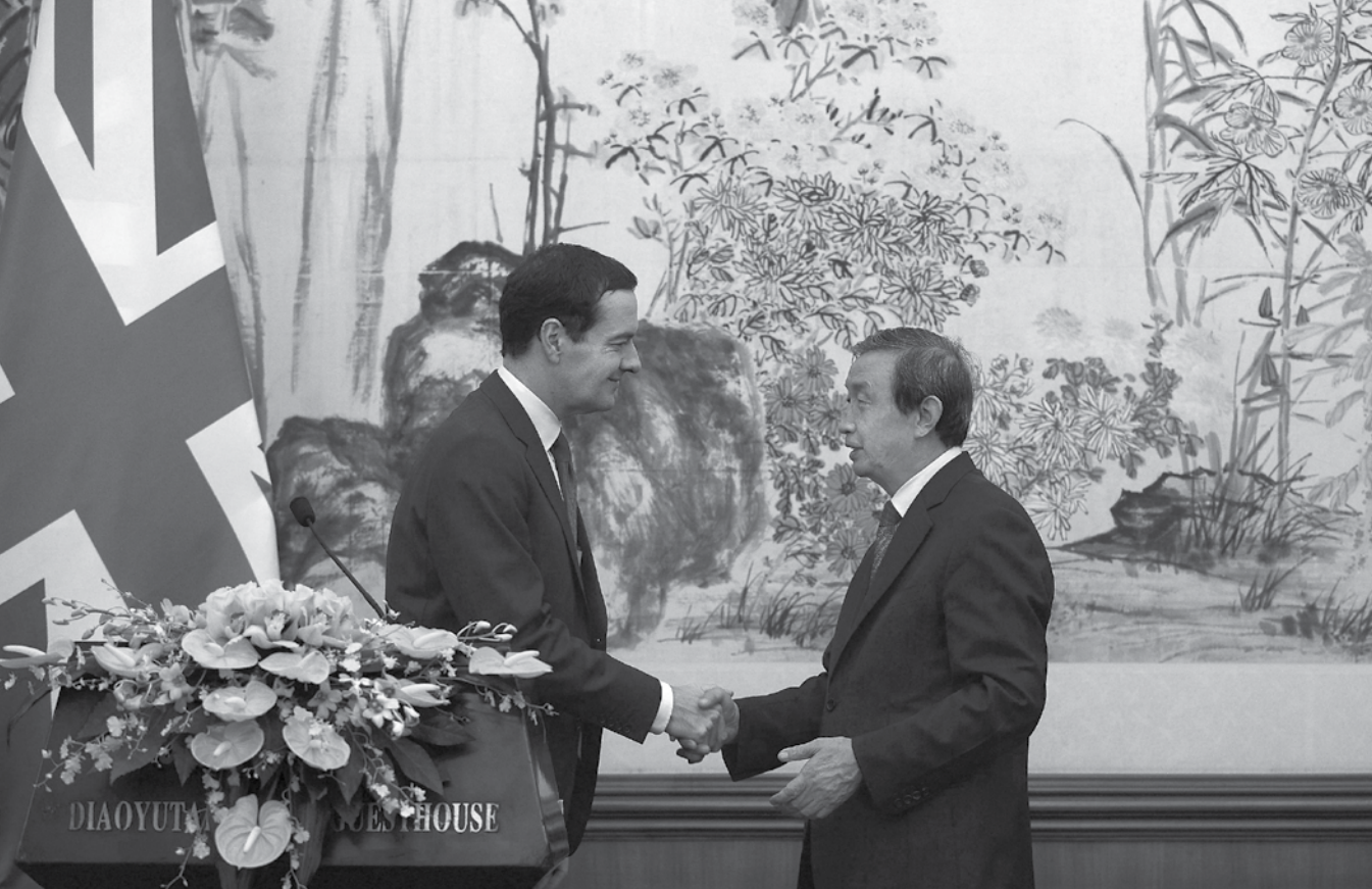
Britain's Chancellor of the Exchequer George Osborne with China's Vice Premier Ma Kai.