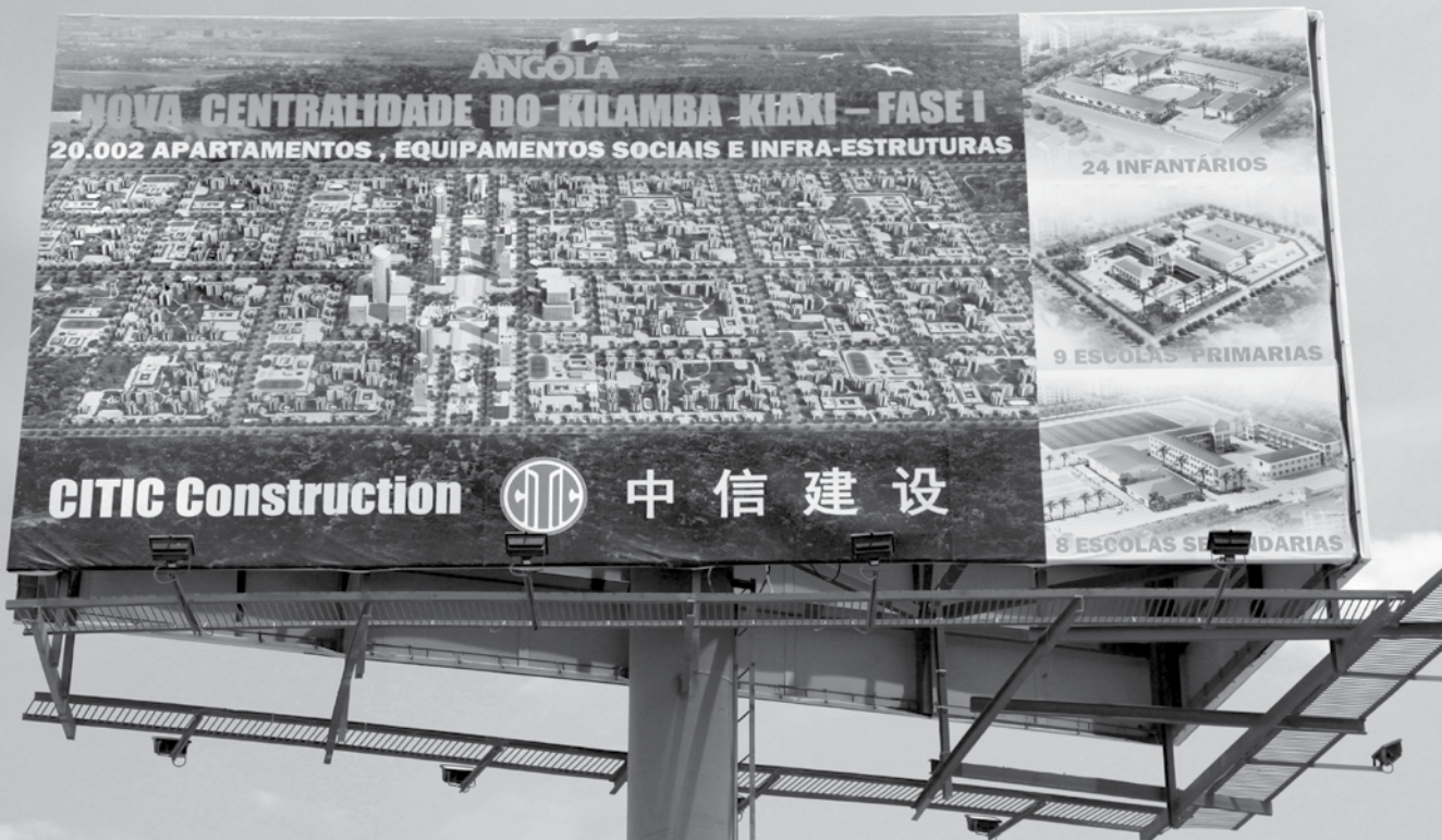
Chinese housing project near Luanda, Angola.

6 percent. To leave no ambiguity about who will be calling the shots, the headquarters was located in Beijing.