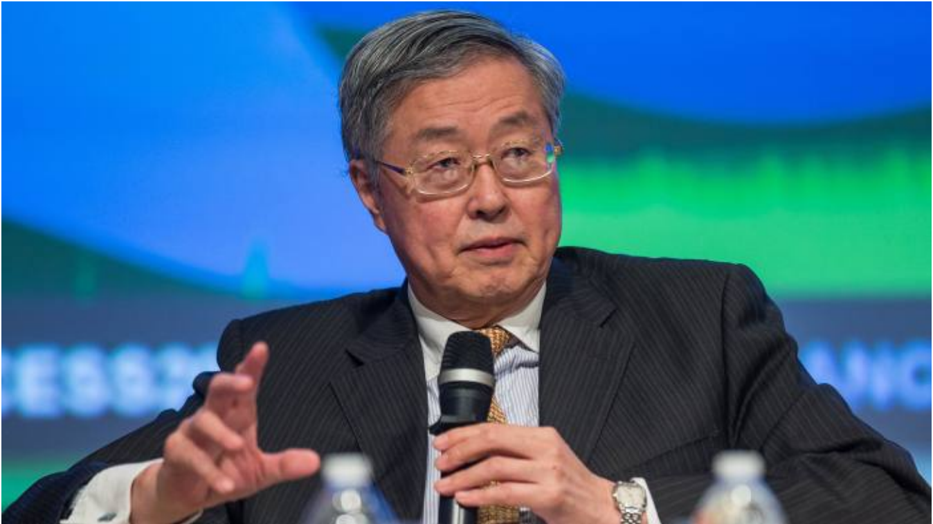
PBoC governor Zhou Xiaochuan, a backer of the renminbi policy

“There is a fundamental conflict between preserving stability and allowing the freedom and flexibility required of a global currency,” says Brad Setser, senior fellow at the Council on Foreign Relations and a former US Treasury official. “Now that the cost is becoming clear, Chinese policymakers may be realising they are not willing to do what it takes to maintain a global currency.