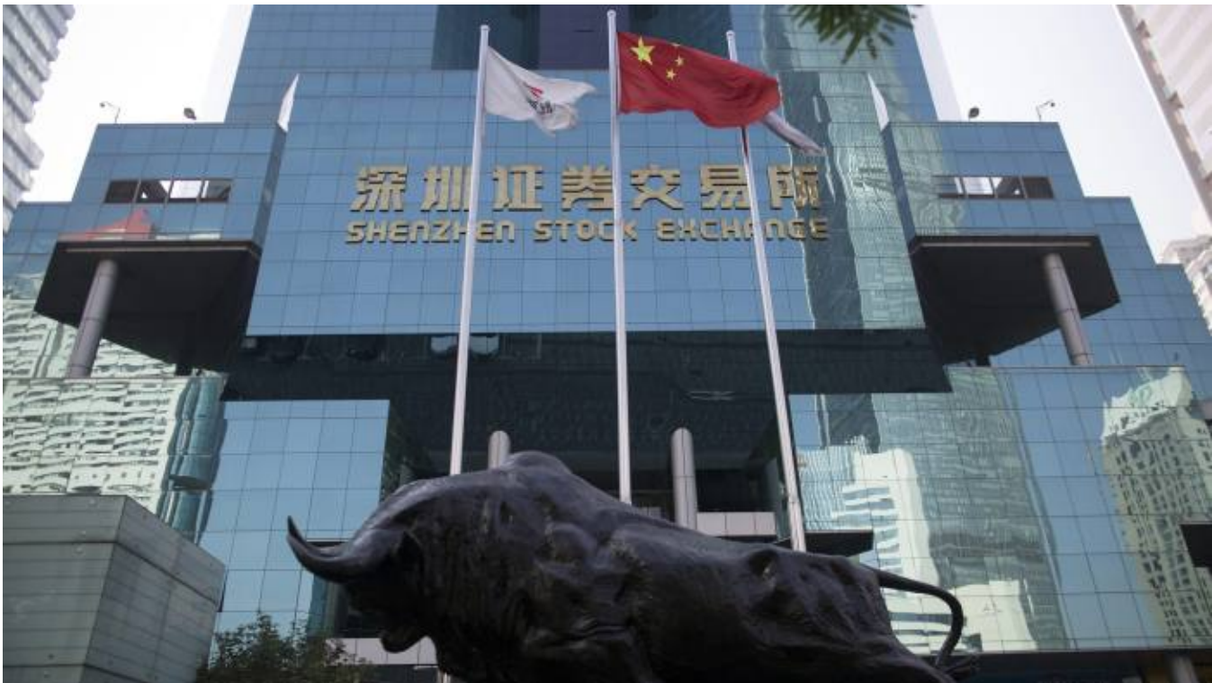
The Shenzhen stock exchange in Guangdong province, China

The result has been a hybrid policy that traders call a “dirty float”: the exchange rate is responsive to market forces but PBoC intervention limits the extent of its movements.